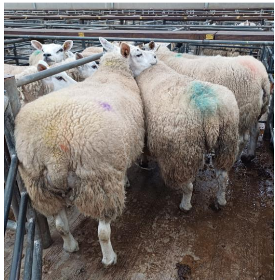
TOP PRICE EWES - £308

Please ensure all VAN numbers are available when booking in your sheep